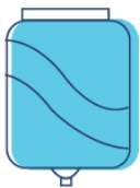
Gravity Feeding Bag

Important: If you have a jejunostomy tube, please contact your physician; do not use the gravity method.